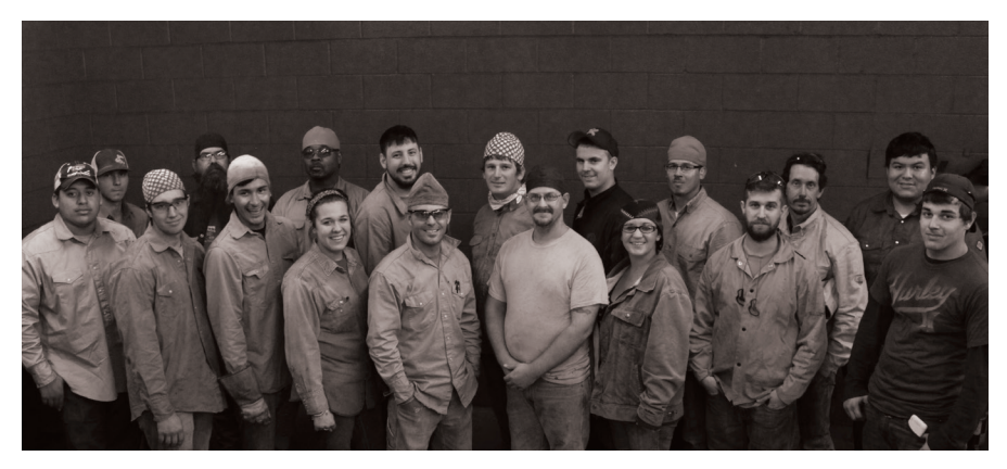
2015 Welding Students

Continuing Education certificate of achievement is a Coordinating Board-approved workforce education certificate containing a coherent sequence of continuing education courses totaling 360 or more contact hours and listed in the college's approved inventory of programs.