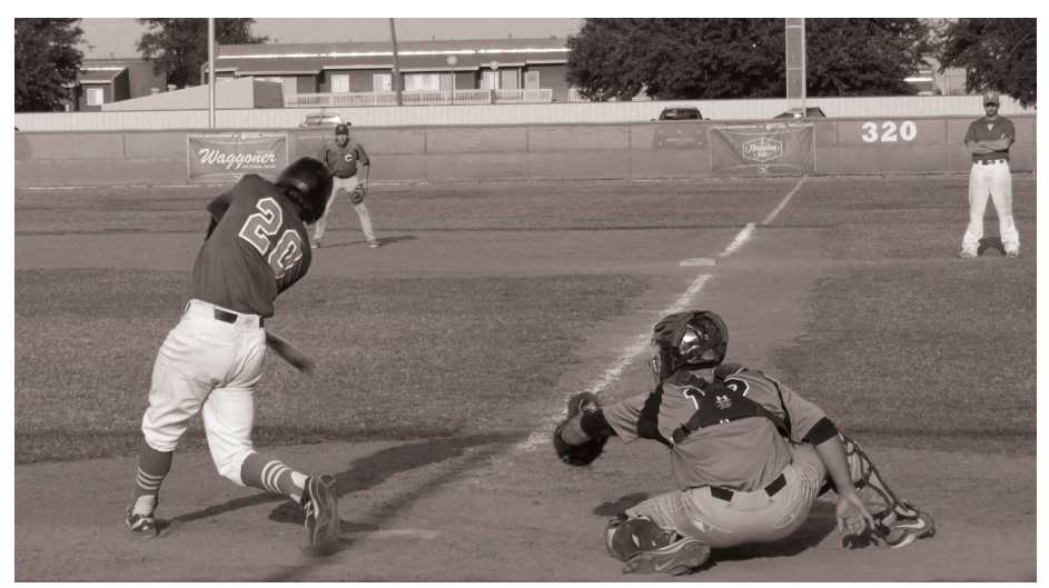
Vernon College Baseball Scrimmage Fall 2015

Any questions concerning the student's residency classification should be clarified prior to enrollment at VC. Changes of address affecting residency should be reported promptly to the Office of Admissions and Records.