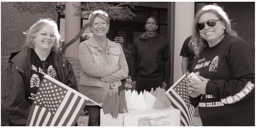
Vernon College honored Veterans at Century City Center during Walk for Warriors 2015

Distance education courses not in the College catalog/schedule may be available to Vernon College students through the Virtual College of Texas (VCT), a collaborative effort among Texas community colleges. Through VCT, eligible Vernon College students may register through Vernon College to take distance education courses from other community colleges throughout Texas. Student eligibility requirements and restrictions to VCT enrollment can be viewed on page 5 of the VC Distance Education Student Manual which is available on the VC website. For additional information about the Virtual College of Texas (VCT), students may access the VCT web site at <a href="https://www.vct.org/new.php#">https://www.vct.org/new.php#</a>